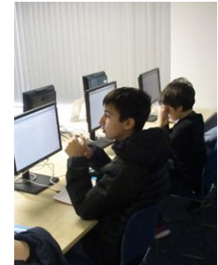
Programming using Twine