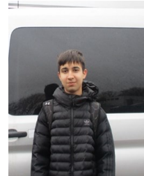
Outside the Centre

I really enjoyed the trip and the day seemed to go very fast. I would like to go again.