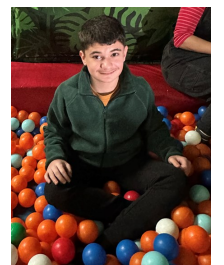
At Safari Soft Play